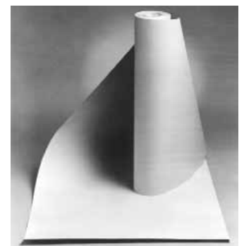
Our Paint Booth Floor Paper is available in a variety of widths.

Paint Booth Floor Paper, PBF-P Kraft paper available in a variety of widths to save time and money while protecting paint booth floors and surfaces from spills and oversprays.