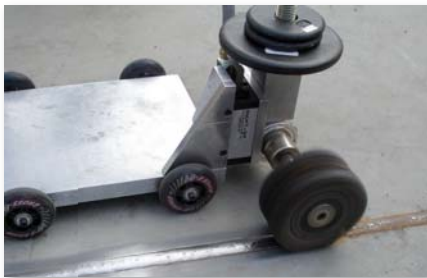
Shown with optional weight spindle

13509 Dynastraight® and Bristle Brushes Sold Separately